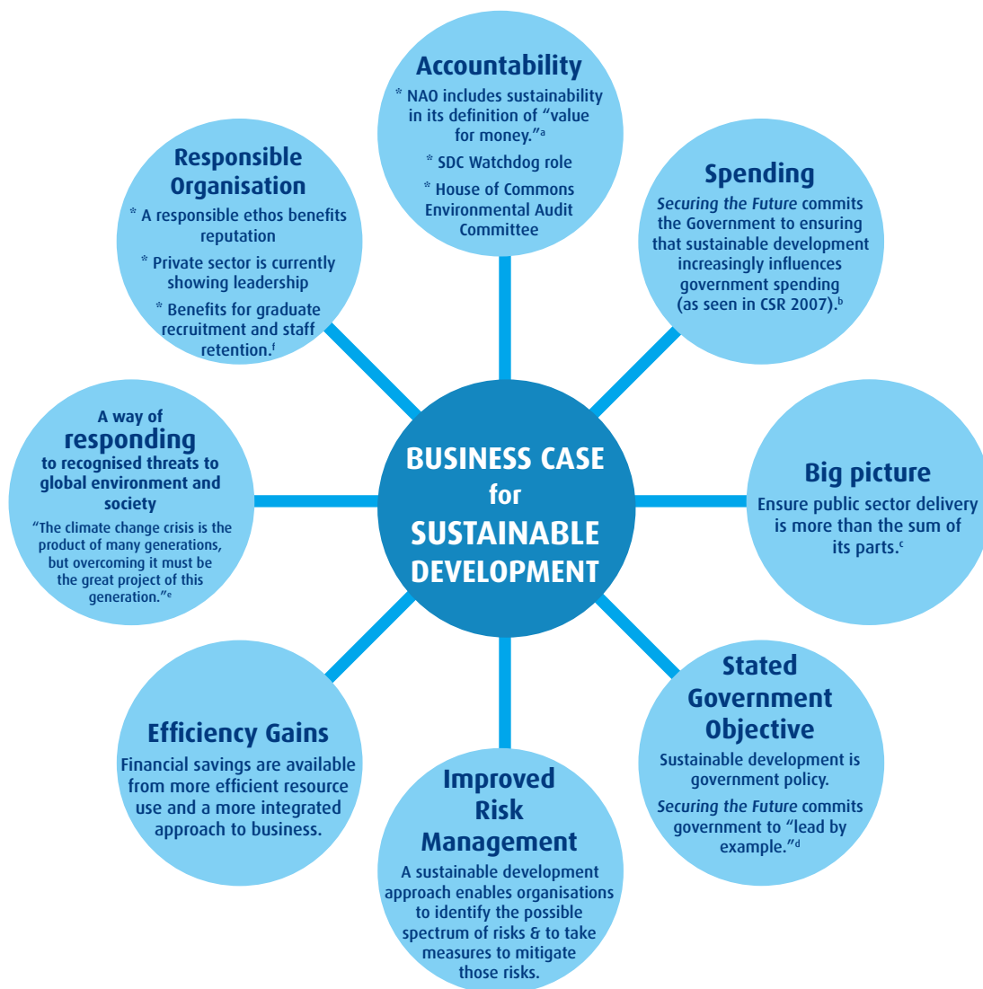
Figure 4 The business case for sustainable development